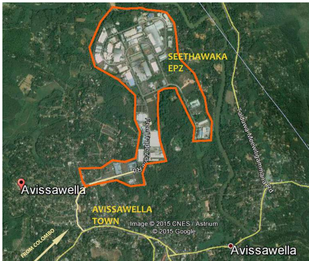
Fig. 1 Map indicating the location of Seethawaka Export Processing Zone.

The site could be accessed from Colombo – Ratnapura (A3) Road.